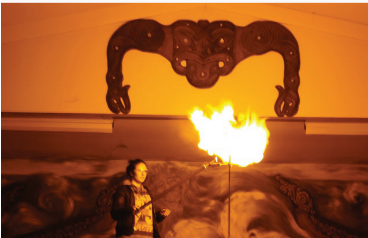
A student from Te Wharekura o Arowhenua explodes a hydrogen balloon at Murihiku Marae. (Science Wānanga case study)

Their work often involves building and maintaining relationships, seeking and managing funding and resourcing, and identifying areas where research or evaluation is needed to enhance and refine programmes. The research showed that people in these positions are often employed on fixed-term contracts and need to periodically reapply for funding or seek new funding sources to ensure their work can be sustained over time. There also seem to be relatively few opportunities for people in these connector/intermediary roles to connect and network with each other at a regional and national level. These are challenges for building capacity across the sector.