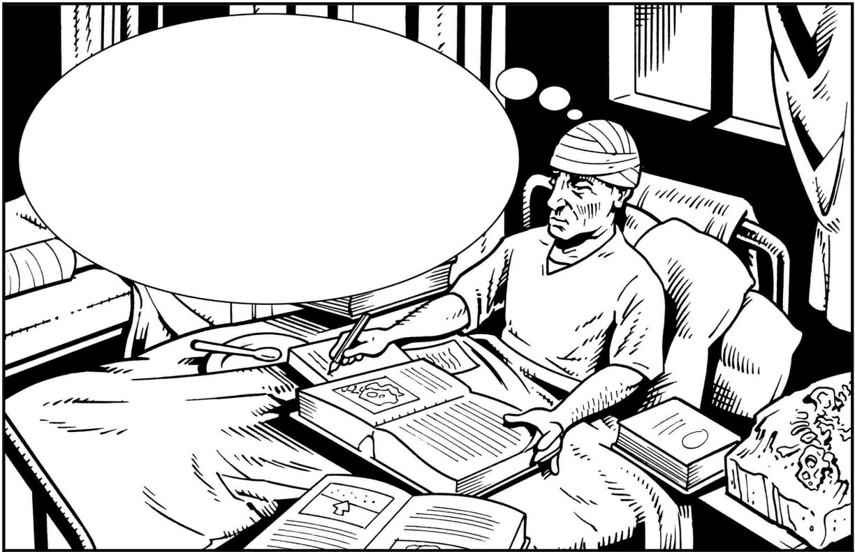
WWI, 1914: Wegener conducts some research ...