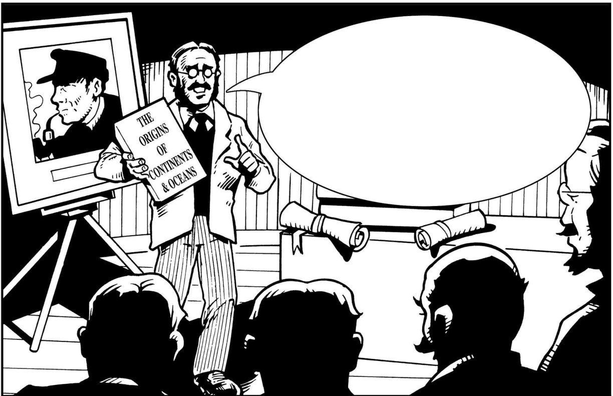
1915: Scientists debate Wegener's theory ...