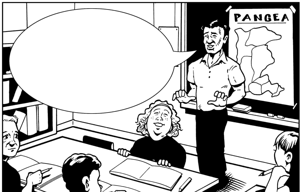
Present day: what do we think now?