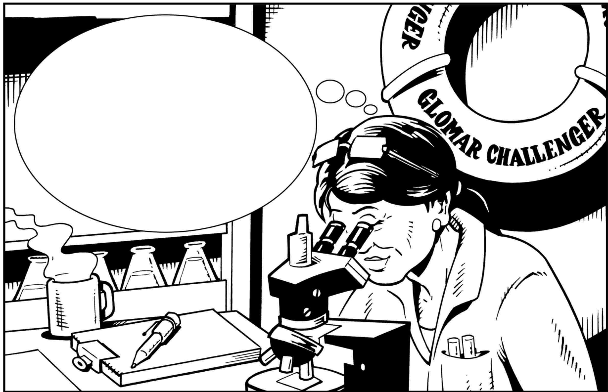
1965: Scientists investigate the evolution of ocean basins ...